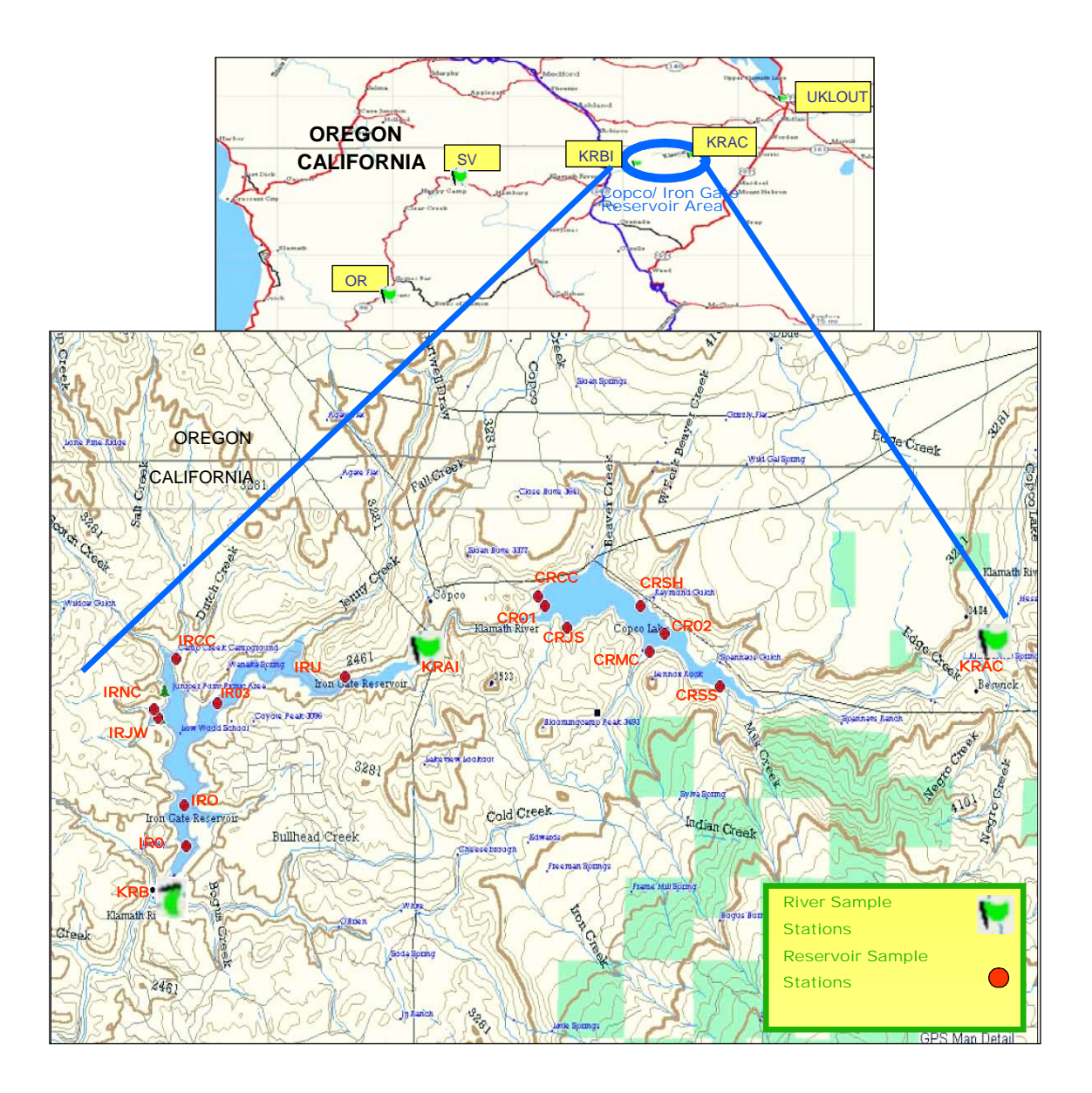
Figure 1. Location of Copco and Irongate Reservoir and Klamath River toxic cyanobacteria sampling/photo stations, 2006. (note: not all stations sampled in each sampling period)