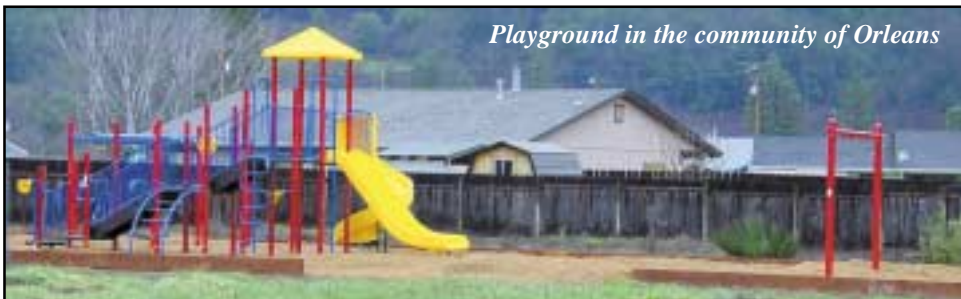
Playground in the community of Orleans

The Karuk Tribe Housing Authority has purchased brand new playground equipment for the communities of Yreka and Orleans. This was a long overdue project, and we are excited to give the children a safe and fun playground to enjoy themselves in. Special thanks go to North State Playgrounds and Randy Davies Construction for their hard work.