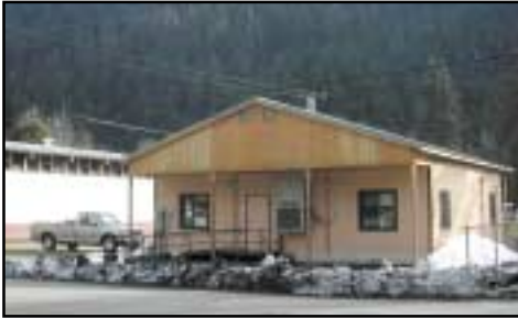
Updated photo of the Karuk Tribal Pharmacy still under construction. Taken January 16, 2004.

Due to the extreme weather in Happy Camp just prior to the New Year, we have had some additional construction delays. The pharmacy will be opening in early February of this year. Prescriptions sent to the pharmacy will be available for pick up at the Yreka and Orleans clinics the following day. For those patients who live in remote areas, prescriptions can be mailed. The Karuk Tribal Council has approved the pricing schedule which will be used. The policy is as follows: