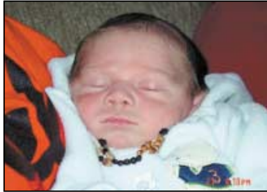
Picture is at 12 days old.