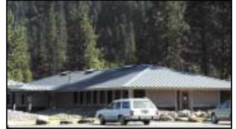
Happy Camp Dental Clinic

March 7, 2004 to March 14, 2004 has been designated by the American Dental Assistants Association, along with the American Dental Association, and the Canadian Dental Association, as the perfect time to acknowledge and recognize the versatile, multitalented members of your dental team – the dental assistants.