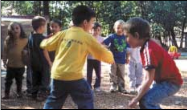
Happy Camp Head Start children performing a demonstration Brush Dance on the playground.