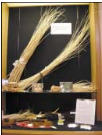
Display of basketmaking materials at the People's Center

and Karuk are baskets. The examples shown here are only some of the many fine examples of the Karuk basketweaving art that are on display at the People's Center.