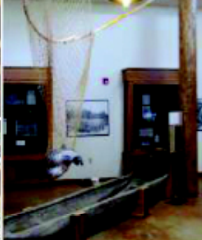
"The Karuk Peofle's Center is devoted to THE PRESERVATION, FROMOTION AND CELEBRATION OF KARUK HISTORY, LANGUAGE, TRADITIONS AND LIVING CULTURE.