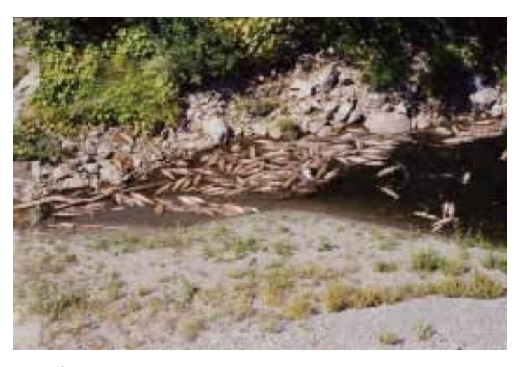
Photo of 2002 Klamath River Fish Kill

"This year is similar in many ways to 2002. That year we had drought conditions and a large run of fish coming into the system. The low flows and large run led to crowded conditions for the fish which allowed a disease outbreak and resulted in the fish kill. To reduce the risk of the same from occurring this year we need to increase flows to lower water temperatures and