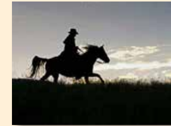
Horse Back Riding