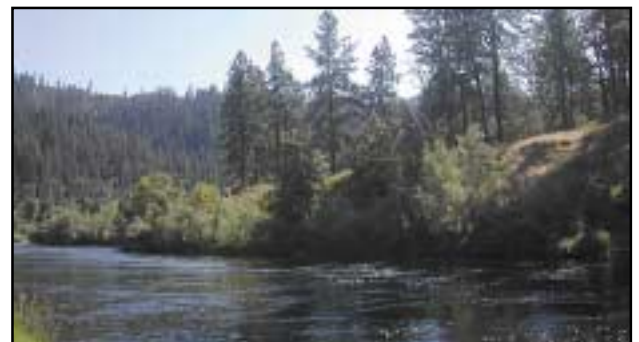
View of the Klamath River, and Ishkêsh Tribal lands

more information about job listings. On this website you can download an employment application as well as read full position descriptions for vacancies. As you can see from these photos, Happy Camp is a beautiful community to live and work in!