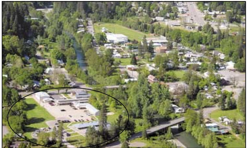
Ariel view of Happy Camp. Circled in black is the Admin Office and other Tribal buildings and structures.