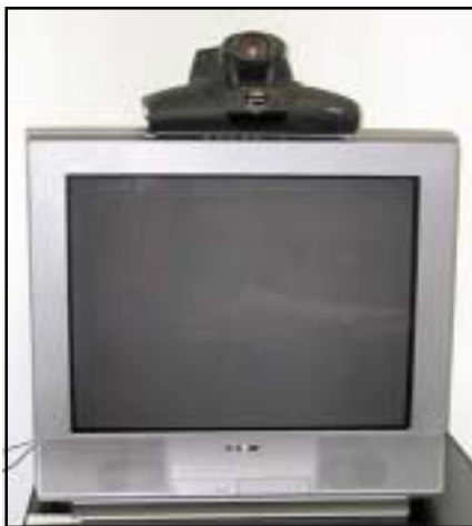
Telemedicine Unit located at the Yreka Clinic

The Karuk Tribe will be expanding our telemedicine capacity by installing two new telemedicine units. One will be in Happy Camp and the other in Orleans.