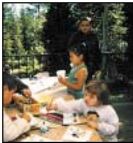
Age groups 3 to 5 painting

We have been busy providing culturally-centered healing therapies that help the children with the knowledge necessary to understand their place within the dominant society, assist them to develop a sense of self and purpose, collaborate within group settings, instill pride in their heritage, and develop resiliency. On August 12-16th a cultural camp was held at the Shasta Methodist Campground in Mount Shasta, CA, near Castle Lake. Each day started at 7:00am with a wake-up call to begin the day's activities. For the five days of the camp, the participants enjoyed a number of cultural activities that included necklace making, ceremonial bow making, acorn paddle making, basket weaving, hair ties, cards, and many presentations on Karuk culture and other Native American cultures. Drug and alcohol presentations were made each day from the youth mentors who attended the camp. Youth workers Latoya Super and Tonya Albers worked with the 3-5 age group helping them with different projects such as finger puppets, necklaces, painting and feathers. The camp ended with a family dinner with the highlight of acorn soup and salmon. The program also had participants attend the ceremonies throughout the summer with the highlight of the World Renewal Ceremony at Ka'tim'iin. Youth mentor participant, David Goodwin served as the Fataveenaan (Medicine Man) for this ten-day ceremony.