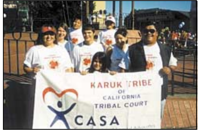
Karuk Tribal CASA Team Fun Run Participants

Once accepted, volunteers receive the tools they need to serve as a CASA, including in-depth training and ongoing monthly support sessions. They learn about courtroom