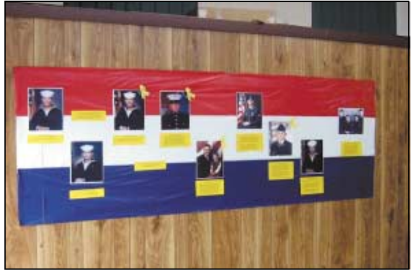
Military Honor Wall at the 2004 Karuk Tribal Reunion

At the reunion in September we had our first “Honor Wall” to display the photographs and stories of our people who are serving or have served our country. For those of you out there who have a member of your family currently serving in the military or have past service in the military, please contact me to put their stories in the next newsletter. I have enjoyed being a part of honoring our Tribal members and descendants service and want to continue to do so in the future. I encourage everyone to get involved. Contact your local ombudsman to find out how you can support our troops in Iraq and overseas. There are many “Adopt a Soldier/ Sailor” programs where you can correspond with someone and send them a care package over the holidays. So, if you have a story about a Tribal member or descendant in the military, please contact me at 800-505-2785 extension 2017. Yootva.