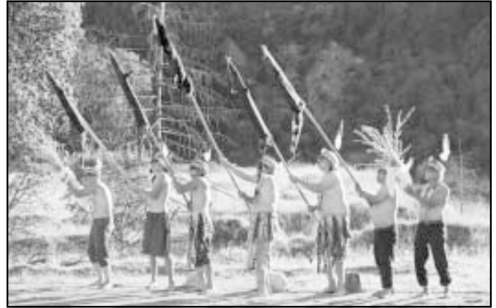
Tishawnik Medicine Dance, 2004

Now, I would like to take a moment to express my gratitude and pride, by honoring our Tribal youth who are currently serving in the Armed Forces.