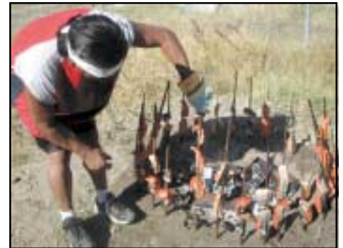
Brian Colegrove, demonstrating traditional salmon barbecue to local students

What is a teacher? Is it a person who will teach valuable things only if they get a steady paycheck? Is it a person who has boundaries of what to teach? Who taught you the things you know? Was it a person who went beyond their obligation, and came to your home every time you failed to attend school each day? If you can't answer these questions than that person