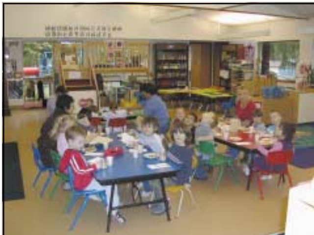
Happy Camp Head Start children, staff & volunteers at breakfast time

How I wonder what you are Tani xuti akay iim