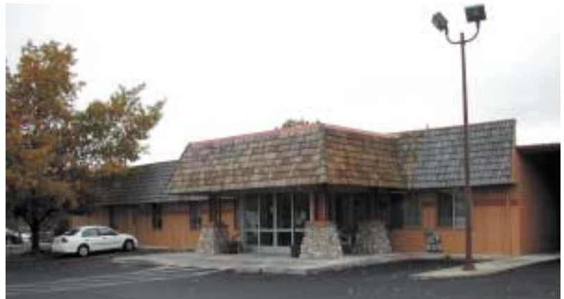
Karuk Tribal Health Clinic, Yreka

I hope this answers many of your questions about the Medicare Prescription Drug Card. Please feel free to contact your elders' worker if you have additional questions or you can reach my office by calling 493-1600.