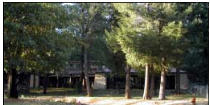
Karuk Head Start Administrative Office and Happy Camp Center

The Head Start Administrative offices are now housed at the offices located next to the Happy Camp Head Start Center at 632 Jacobs Way in Happy Camp. Our phone number is 530-493-2226, and our fax number is 530-493-2223. Stop by and visit our new location.