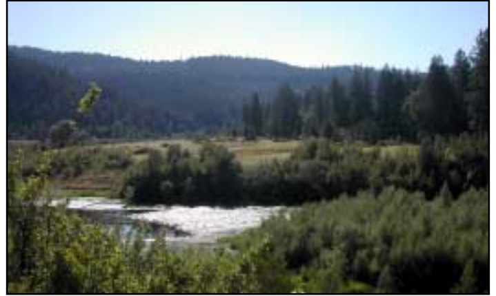
Ishkêesh Ranch, Happy Camp