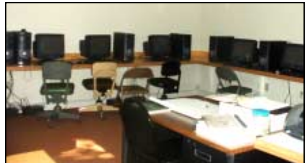
The Orleans Community Computer Center, is now housed in Panámniik Center and open for use

Our library is also used for Karuk Tribal Court and Karuk Language classes. The center offers space for meetings to Karuk Housing Authority Tenant Group, Orleans Community Service Club, and Karuk Basket Weavers.