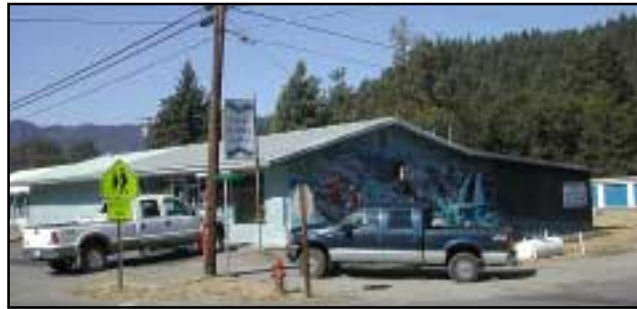
Karuk Building Center in Happy Camp

Building Center, Design Works, and a construction company. The Karuk Building Center is still operating, but it is not profitable, and the Tribe has had to contribute capital to continue its operation. With the help of grants, Design Works, a rustic furniture business, was started. The products of Design Works were very nice but Design Works did not generate a profit, and is no longer in operation. The construction company started by KCDC lost money and was discontinued. When the construction company was dissolved, the Tribe paid off its debts.