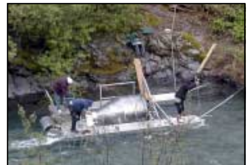
Fisheries crew hard at work on a chilly spring morning

For the third quarter of this fiscal year, March 1 through June 30, this office reviewed a total of fifteen (15) grant applications that were submitted for funding totaling $3,479,393. Eighteen (18) Independent Contractor agreements and two (2) amendments were reviewed and submitted to the Tribal Council for approval. Nine (9) grants were closed out. The Tribe received notification of award for nine (9) grants totaling $823,051. These included Department of Natural Resources grants for Watershed Restoration Projects (NOAA, BIA) $136,964; Fisheries Projects (BOR, USFW) $115,343; Department of Health & Human Services (Elders Programs, Title IVB and Head Start) $570,744.