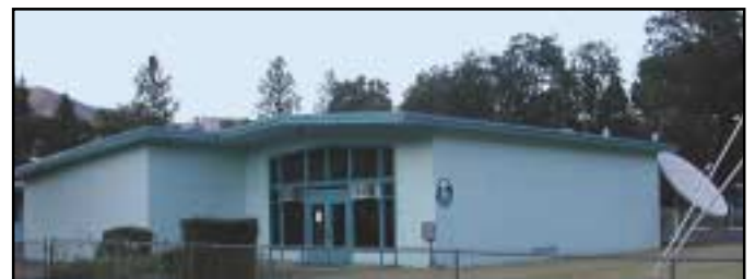
Happy Camp Community Computer Center

The Happy Camp Community Computer Center was closed for the month of July so that Happy Camp High School could clean the facility and so that an inventory of furniture and equipment could be taken. The Computer Center is scheduled to reopen on August 2, 2004.