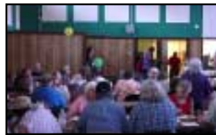
Dinner at the 7 th Annual Tribal Reunion