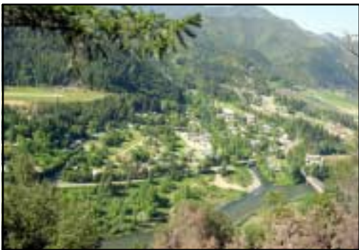
View of Happy Camp from the Town Trail. The Karuk Tribe of California Administration office complex is located in the center of the picture.