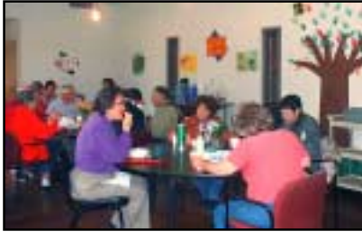
Mealtime at Panamnik Center

Orleans - We have been serving senior lunches at Panamnik Center in Orleans since February 13, 2004. Everyone is invited to attend our Grand Opening celebration on May 13, 2004 at 3:00 p.m. The May Health Board Meeting will follow the Grand Opening.