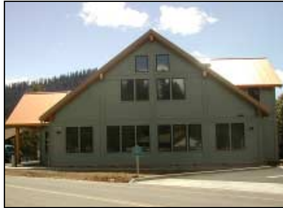
Newly built Karuk Tribe Housing Authority office building

Happy Camp has a new Tribal pharmacy building on the grounds of the Tribe offices. This building was once used by Head Start near Happy Camp Elementary School, and was relocated to Second Avenue. Our force account crew built a new “no-leak” roof, totally renovated the interior, repainted the building and made a silk purse out of a sow’s ear for our pharmacist and staff. We will soon add a new driveway lane off Second Avenue to allow for two-way traffic into the parking lot, and parking spaces for the pharmacy.