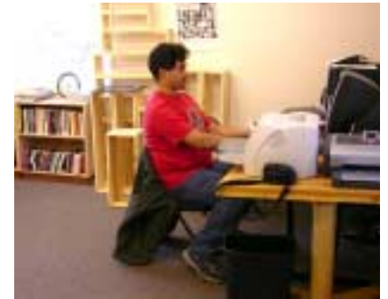
The People's Center Library

Library: The People's Center Library is supported by a Basic Grant from the Institute of Museum and Library Services and contains some 550 books, videotapes and periodicals that are available for use on-site during regular daily hours and on Tuesday and Thursday evenings. Two computers and a printer are available in the Library for research and word processing.