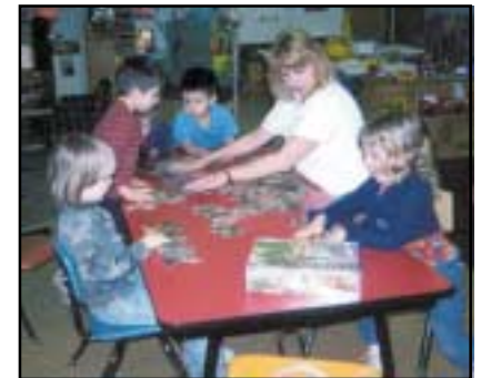
Hands-on learning at the Yreka Head Start Center

Karuk Head Start is a full service program, providing bus service, nutritious meals, services to children with special needs, medical and dental examinations, hearing and vision screenings. We implement the Creative Curriculum with a strong emphasis on early literacy, language, and numeracy skills, including social/emotional development, culture and the Karuk language.