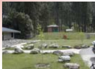
Trees planted at the Happy Camp Administration Site

By the time this article reaches print, twenty-two trees will have been planted at the Happy Camp administration site. So far the response has been very positive. The big news for the maintenance crew is the beginning of the excavation for the new Happy Camp Brush Dance pit. This dance site will be located on the Ish