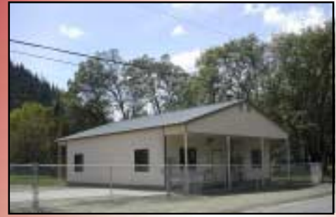
Karuk Tribal Pharmacy, Happy Camp